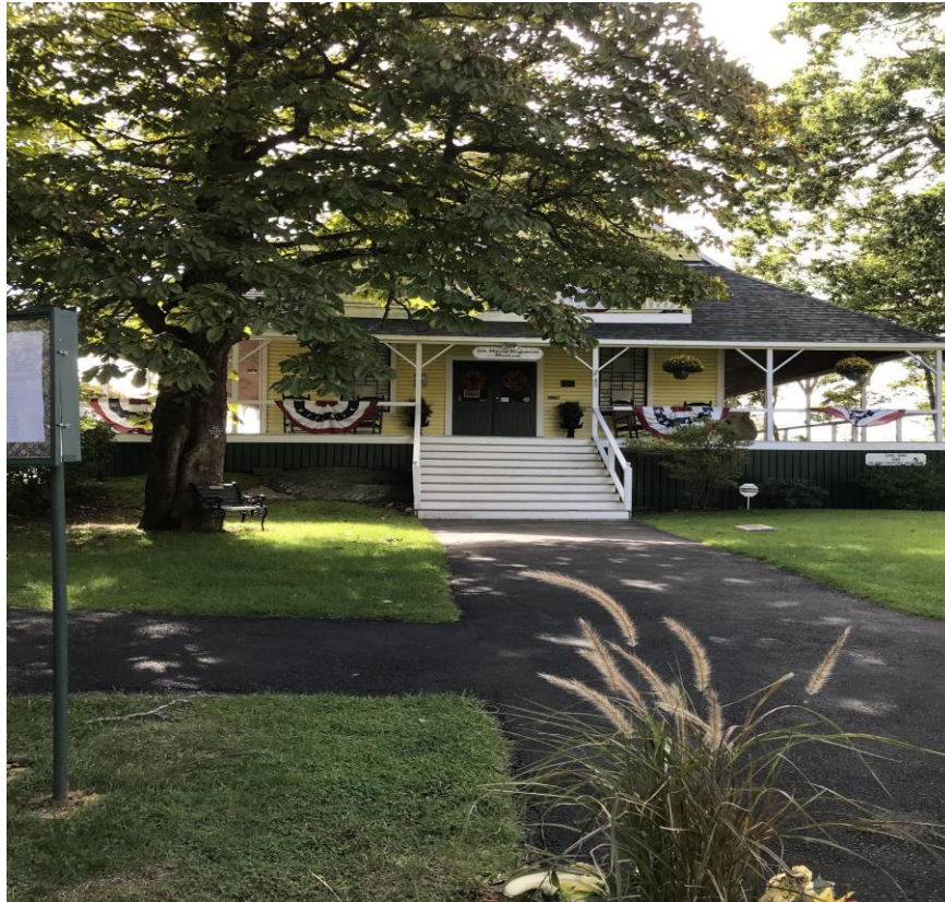
Cottage as seen from the street.

As a birthday gift from my son Tim we went on a short ferry ride from Portland to Peaks Island to visit the 5th Maine Volunteer Regiment Museum. It was a great day and I would encourage all of you to make this trip. The very nice ferry boat ride was a little cool, Maine comfortable mid-50's on the water, that took a little less than thirty minutes. We made the pleasant walk past a number of restaurants and cottages following the signs to the museum.