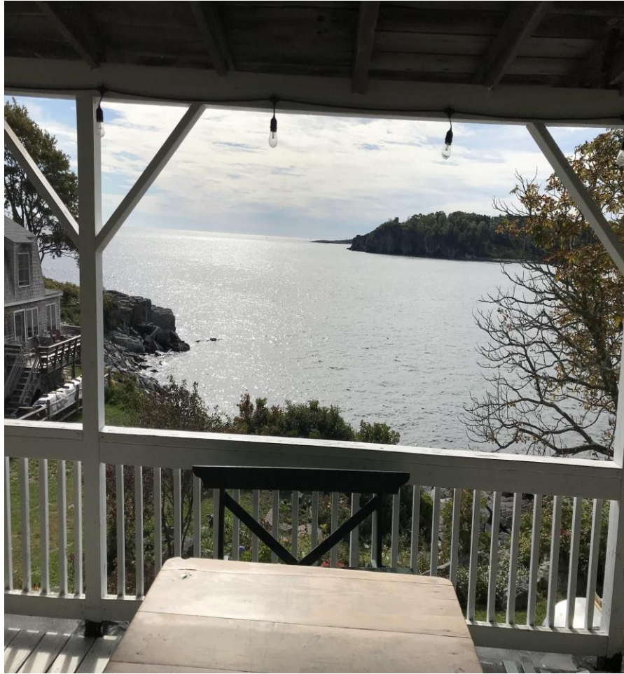
View from the front of the cottage

This view from the front porch of the cottage was shared by the visiting veterans and their families. In June 1885 the G.A.R. held its nineteenth annual encampment in Portland. Many of the veterans visited Peaks Island. Maybe this helped encourage the 5th Maine Veterans to build their cottage reunion hall in 1888!