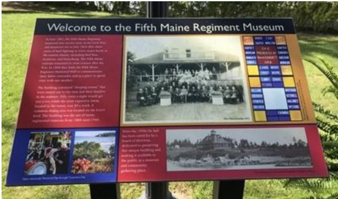
Information placard in front of the cottage.

This placard has a number of well-placed photos. Note the bottom picture showing how isolated the cottage/hall was when it was built. That is not the case today.